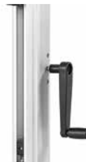
SILENT CRANKING SYSTEM