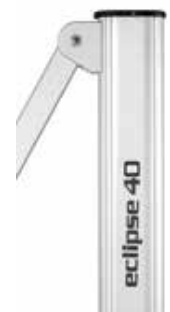
EXTRUDED ALUMINIUM JOINTS

Available Australia Wide Check our website for a dealer near you www.instantshadeumbrellas.com.au